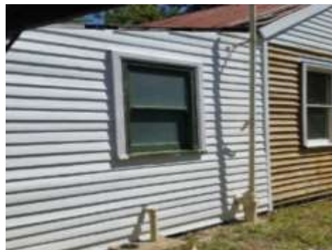
Above Right: exterior painting