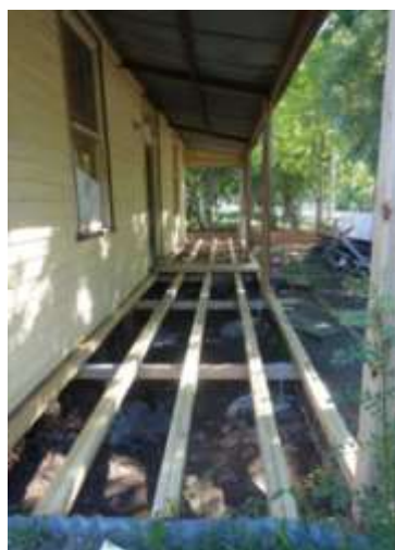
Left: Front verandah sub floor.