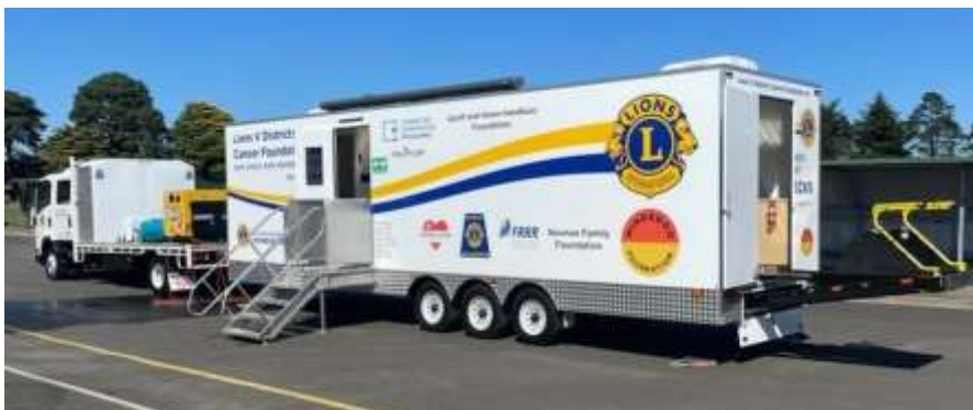
New trailer recently tried by Haddon Lions Club