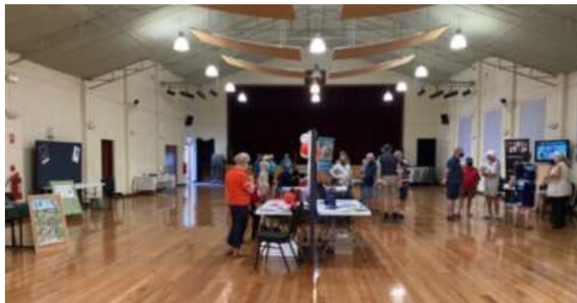
Left: Layout of the Memorial Hall with four rows of community group "kiosks".

Can you Help - At our Volunteer Expo, on February 20th Lions learnt that the Beechworth Red Cross branch are looking for donations of acrylic yarn to knit and/or croquet as many knee rugs as possible before winter 2021. If you can help out with acrylic yarn please contact/send the yarn to the Beechworth Lions Club, P. O. Box 8, Beechworth and we can pass the yarn onto to the Beechworth Red Cross branch.