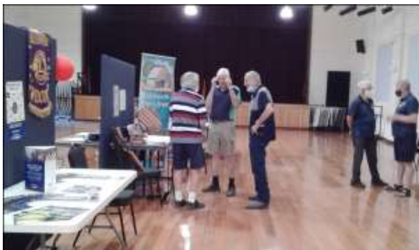
Left: Left to Right: Lions Club, Men's Shed and Rotary Club.

The Volunteering Expo must be judged as an outstanding success: 14 community groups attended; on speaking to the groups at least each group gained a new volunteer and a couple of groups gained 2 new members; existing volunteers had the opportunity to talk to other groups and to share information and that has never occurred before and the Red Cross incidentally gained 2 catering jobs. The Expo was the first one of its kind to be organized in Beechworth; it definitely achieved its purpose of further linking community members to volunteer groups in search of new members in order to do more for the community, and feedback all round was extremely positive.