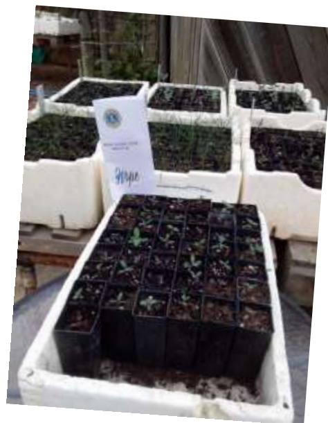
Photos – One kit - 7 boxes of seedlings; 48 tubes – 1 box of Kurrajongs still germinating