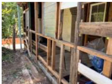
Above: Looking across the rear verandah.