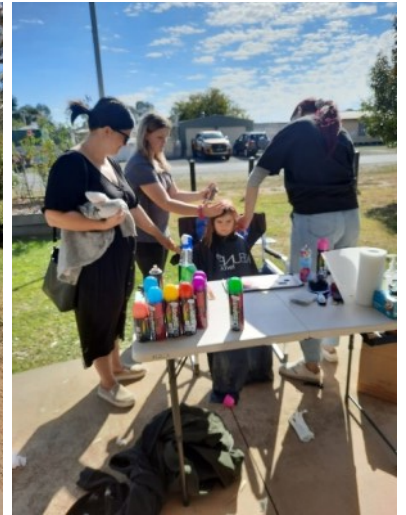
The team from Meraki Hair and Beauty in Numurkah "attack" a willing victim.