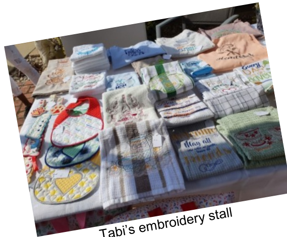
Tabi’s embroidery stall