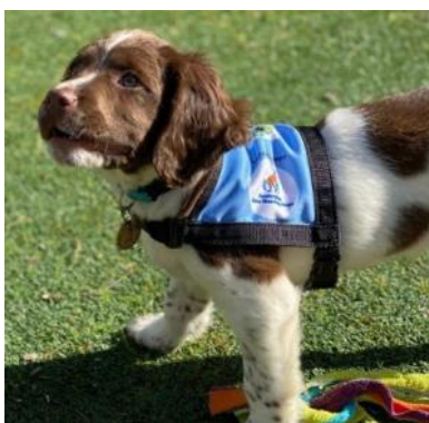
Cody the English Springer Spaniel is learning to be a hearing and diabetes dog

Board of Directors, CEO & Staff - Australian Lions Hearing Dogs