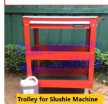
Trolley for Slushie Machine

Price new was $3840, including a trolley worth $350. We are sacrificing this unit and trolley for a mere $1,500. If you are interested or would like more information please contact Lion Ian Jenkins on 0418 505 714.