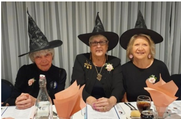
This year's executive – a Coven of Cuties