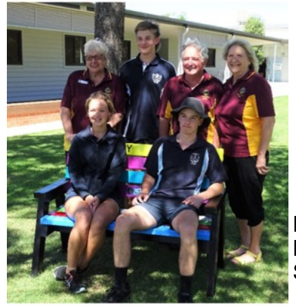
Presentation of Buddy Benches at Sacred Heart

Presentation of Buddy Benches at P-12 Yarrawonga