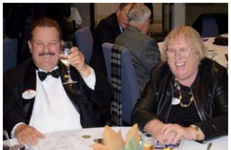
a couple of strangers !!!