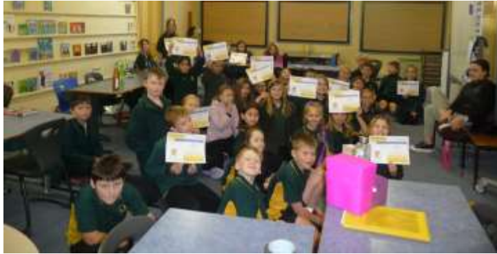
Beechworth Primary School

JUNIOR PUBLIC SPEAKING - Beechworth Lions Club was able to conduct for our second year three school entries into the Lions Junior Public Speaking. The school level competition was held on 16th, 17th and 20th June and Club Level will be held on 24th July.