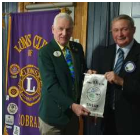
Cobram Lions Club visit