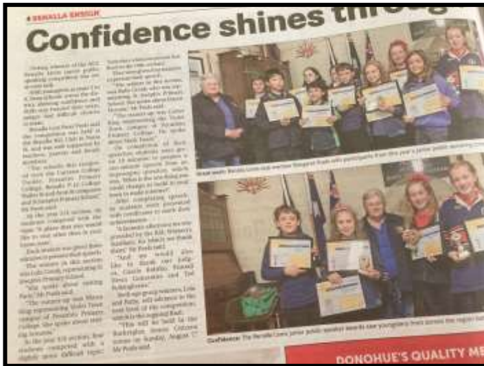
An article about JPS in Benalla

Congratulations to all the students who participated in the District Final, you have all done your clubs & schools proud.