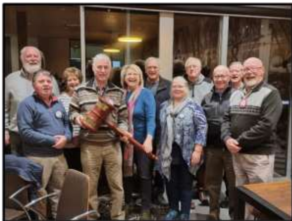
Yarrowonga to Barooga