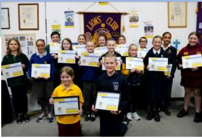
Region 3 Contestants