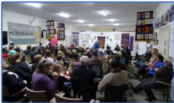
Yarrawonga Lions Clubrooms