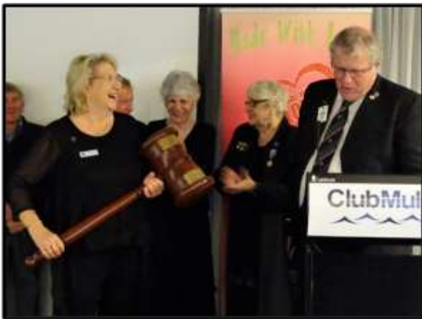
Wangaratta to Yarrowonga